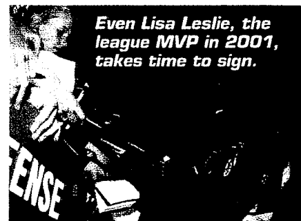
Even Lisa Leslie , the league MVP in 2001, takes time to sign.